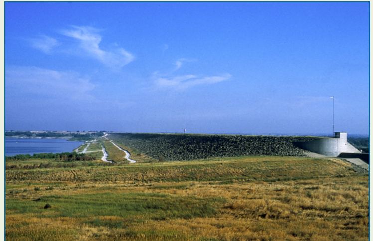
Kirwin Reservoir on Solomon River and Bow Creek

Reduced streamflow and runoff into streams has been reflected in lower water levels in Webster Reservoir, Kirwin Reservoir and Waconda Lake. These conditions and reduced availability of irrigation water stored in the reservoirs have suggested a need to take a fresh look at reservoir management. Maintaining a minimum water level in Webster Reservoir is a basin priority issue. Additional information on this issue may be found in the Solomon Basin priority issue section.