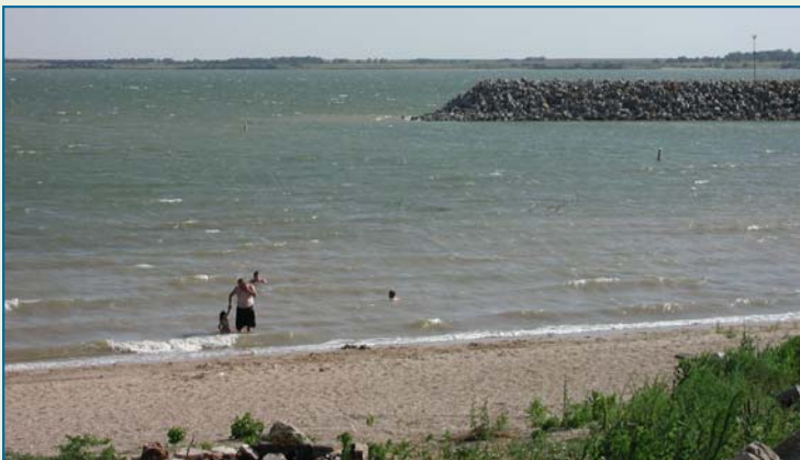
Waconda Lake.

In 2006, there were 49 public water supplies in the Solomon basin. Ground water is the primary source for most public water supplies, accounting for over 95% of the