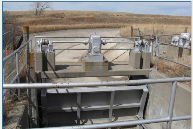
Courtland Canal Diversion Dam Gate.

To provide water to fill the additional storage, winterizing the Superior-Courtland Diversion Dam would allow the Courtland Canal to carry water during the off season. Under current design, the canal system is shut down during the winter season due to potential canal system damage from icy conditions.