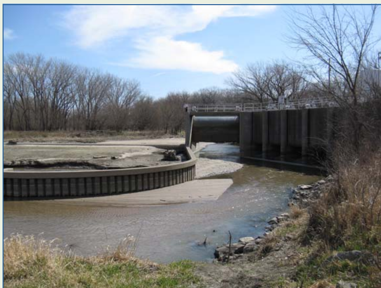
Superior-Courtland Diversion Dam

Non-KBID Irrigators. There are irrigators relying on the natural flow in the mainstem or its tributaries, above and below White Rock Creek. Some irrigators rely on the Republican River flows as it enters Kansas. There are also