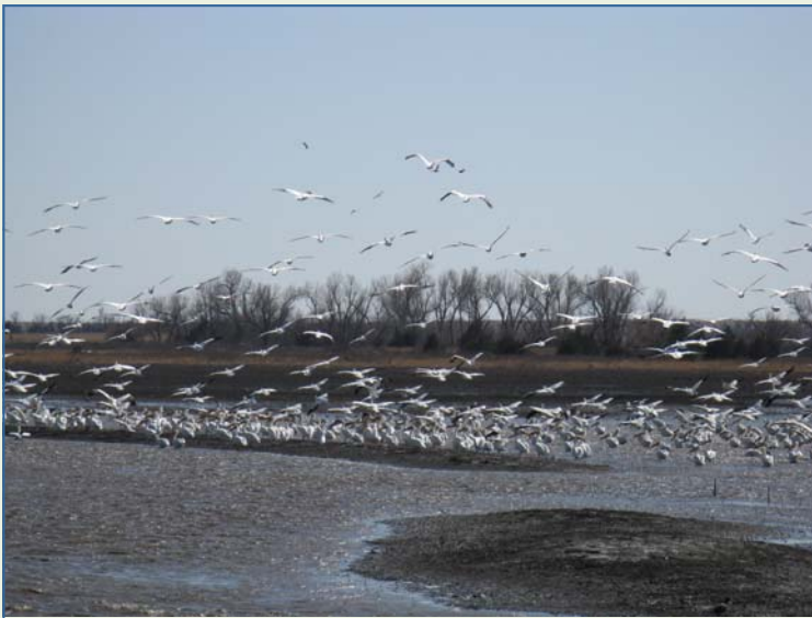
Jamestown Wildlife Area Pelicans.

Jamestown Wildlife Area . Jamestown Wildlife Area is a series of interconnected marshes, pools and upland areas that has been under state management since 1932. Of the 4,729 acres of wildlife managed land, over 1,900 acres are wetlands. This area is located along a major migration route for the Central Flyway. The Jamestown Wildlife Area provides recreational opportunity for hunters, birdwatchers and photographers, with roughly 14,700 visitor-days annually.