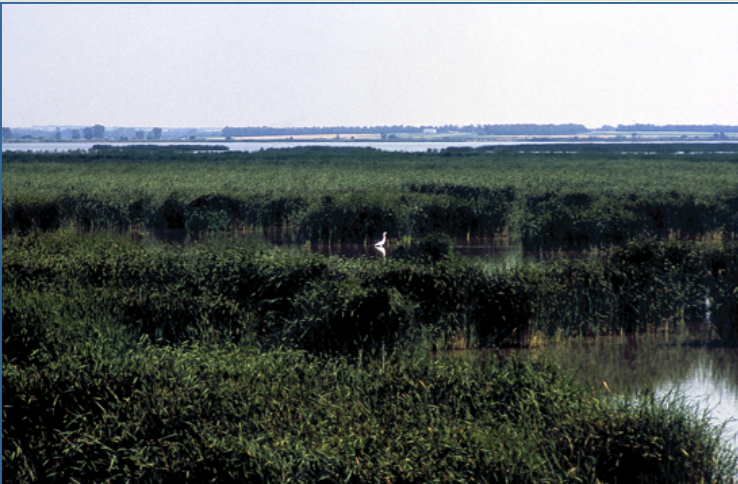
Figure 1. Jamestown State Waterfowl Management Area.

A Reservoir Sustainability Initiative is being developed by the Kansas Water Office (KWO) to address all aspects of reservoir management. Wetland and forested riparian loss in watersheds above federal reservoirs is a priority concern for riparian forest and wetland protection due to their beneficial impacts on water quality and reduction of sediment transport. A Kansas Water Plan Policy Section has been developed that addresses the adequacy of current programs and policies to protect wetlands and riparian areas, and the effectiveness of current targeting of areas for stream restoration programs. Noted in the policy section is that degraded and unstable stream banks are a major source of sediment, especially during high flows. (6)