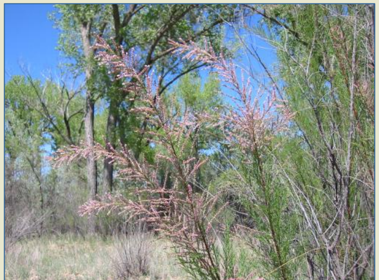
Figure 2. Tamarisk Shrub in Flower.

Riparian lands, especially in western Kansas, have also been seriously impacted by the infestation of non-native phreatophytes. Of greatest concern are the effects tamarisk (salt cedar) and Russian olive are having on our native riparian ecosystems. The invasive thickets provide poor habitat for livestock and wildlife; increase fire hazards; decrease water quality, and generally use more water than native vegetation. Infestations in Kansas are roughly estimated to occupy greater than 50,000 acres. Recognizing the need for a long-term coordinated approach in addressing tamarisk and other non-native phreatophyte control, an inter-agency, multi-organizational team was assembled to develop a Strategic Plan. The 10-Year Strategic Plan for the Comprehensive Control of Tamarisk and Other Non-Native Phreatophytes was adopted by the Governor in 2006.